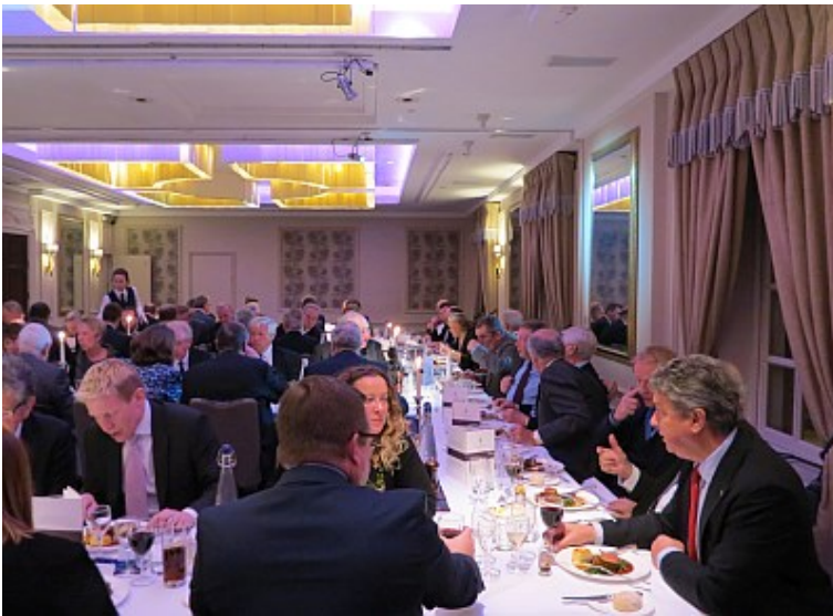
Dinner was most convivial