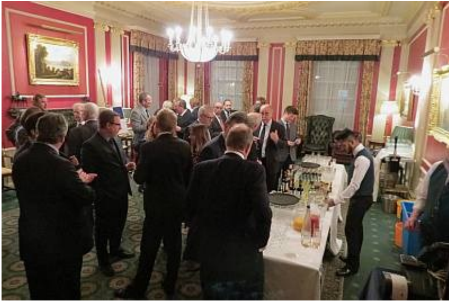
Guests enjoying the reception