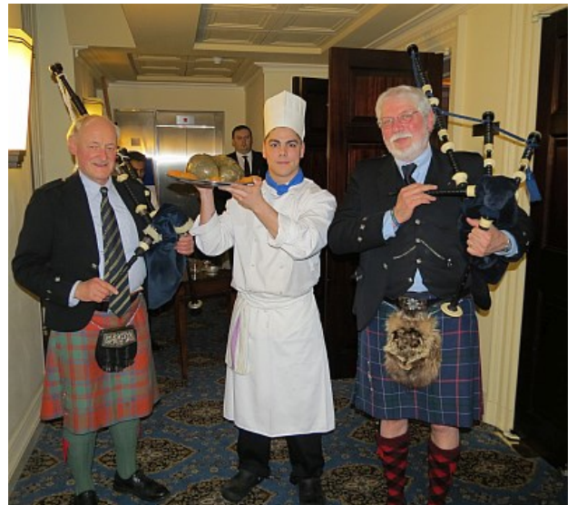
Piping in the haggis